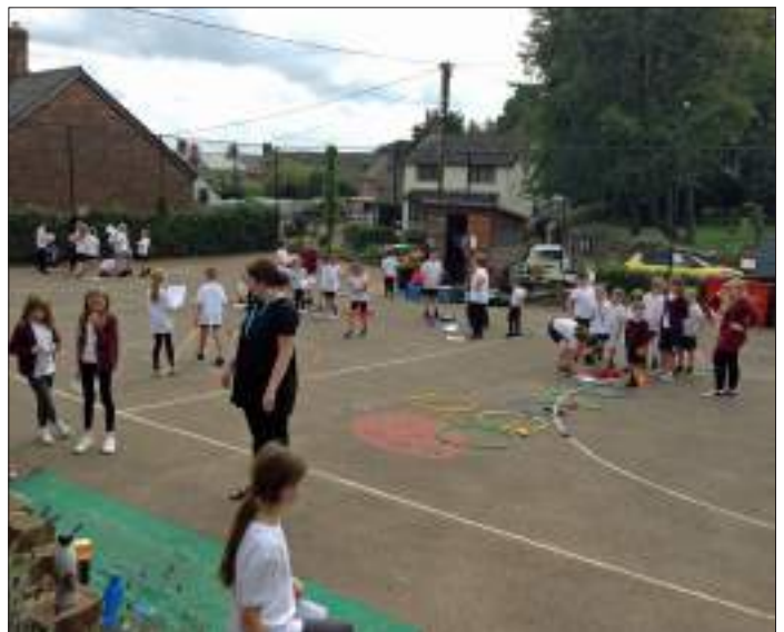
A recent Mini-Olympics afternoon for the whole school was followed by ice creams provided by Friends of the School