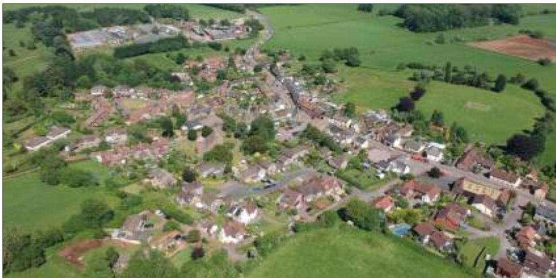
View of the village from Chapel Hill taken in the summer of 2018