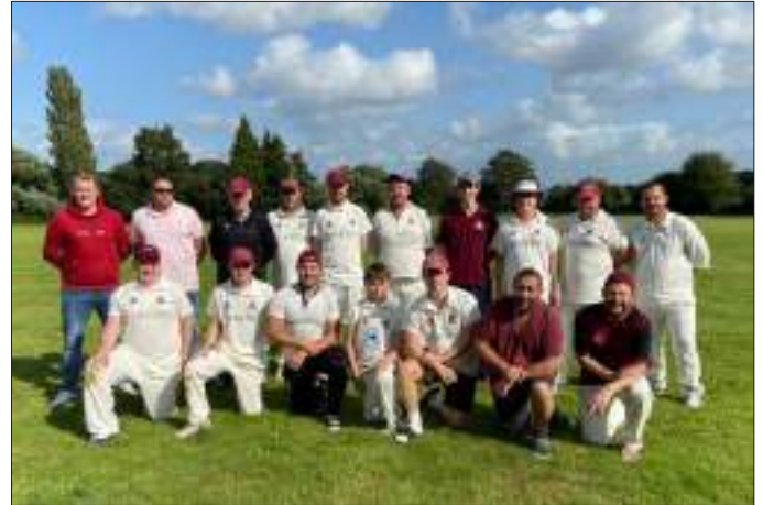
Exiles team for our first-ever President's Match

We have just completed our end of season renovations on the cricket square. This will give us the perfect start when we return to Aylburton next spring