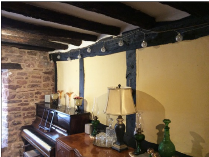
Party wall with No. 30