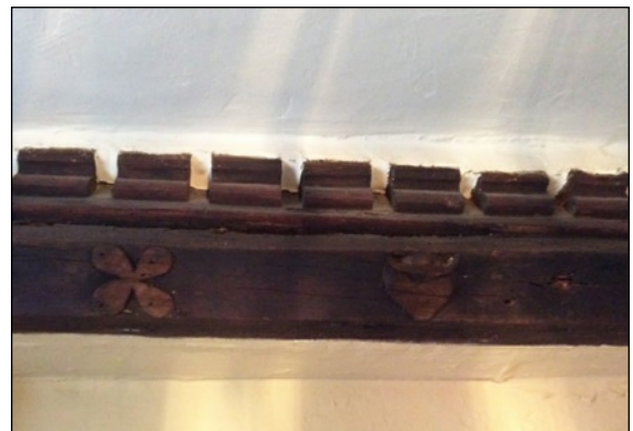
Dais beam in party wall with No. 34